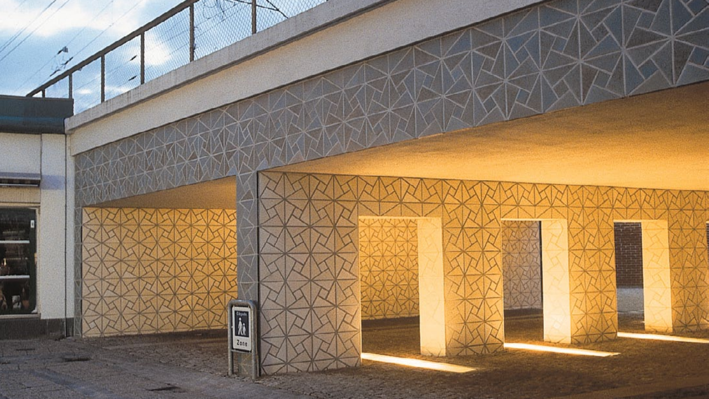
Viaduct. 1999. Handmade high-fired earthenware produced at Petersen Tegl, Denmark; water ponds, water lamps, lights and glass. Located in a pedestrian street in Kolding, Denmark. As a result of a technical installation, the passing trains start a movement of the water and the light is subsequently dancing each time a train passes.

even if you stand with a printed piece of cloth with a quite specific demarcation, in principle it appears to have been taken out of the infinite extension of an ideal pattern. For that is also true: in some strange way repetition also has an idealizing and unifying effect.